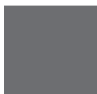
ESCD GRAY Transparency 50%

C: 0% R: 248 M: 32% G: 181 Y: 90% B: 17 K: 0%