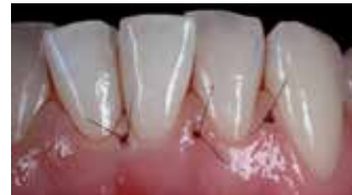
Application image courtesy of Dr. Rino Burkhardt, Zurich, Switzerland